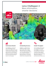
Leica CityMapper-2 More information, smarter decisions

Illustrations, descriptions and technical data are not binding. All rights reserved. Printed in Switzerland – Copyright Leica Geosystems AG, Heerbrugg, Switzerland, 2019. 847023en – 11.21