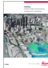
Leica HxMap Unified high- performance multisensor workflow