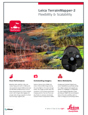
Leica TerrainMapper-2 Highest accuracy for regional mapping points

Leica Geosystems AG www.leica-geosystems.com